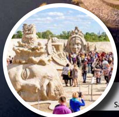
June 11th – 12th – 10th International Sand Sculpture Festival