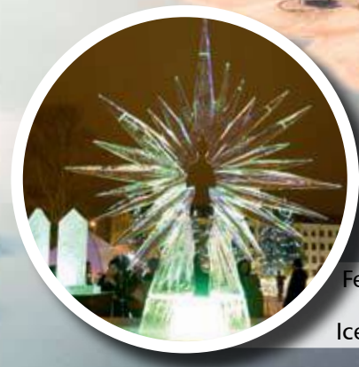
February 5th – 7th – 18th International Ice Sculpture Festival