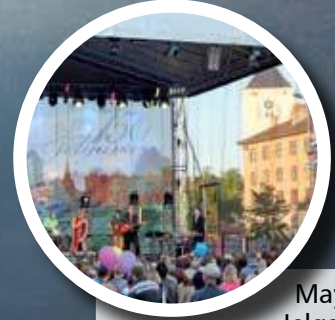
May 27th – 29th – Jelgava City Festival (all around the city, including on Pasta Island)