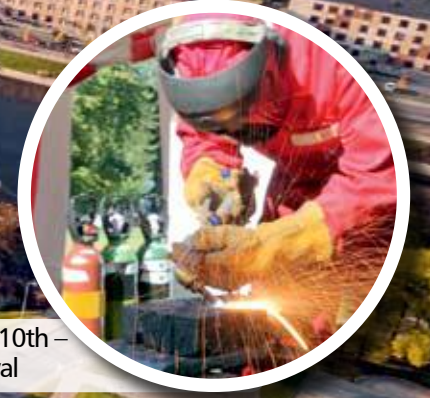
September 10th – Metal Festival