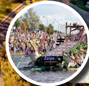
August 27th – XVI General Latvian Milk, Bread, and Honey Festival, XIV Milk Pack Boat Regatta